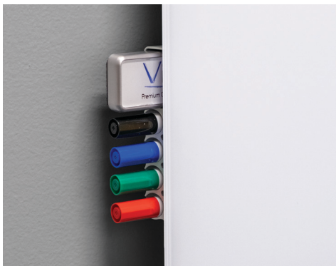
Elegant Hidden Marker & Eraser Tray